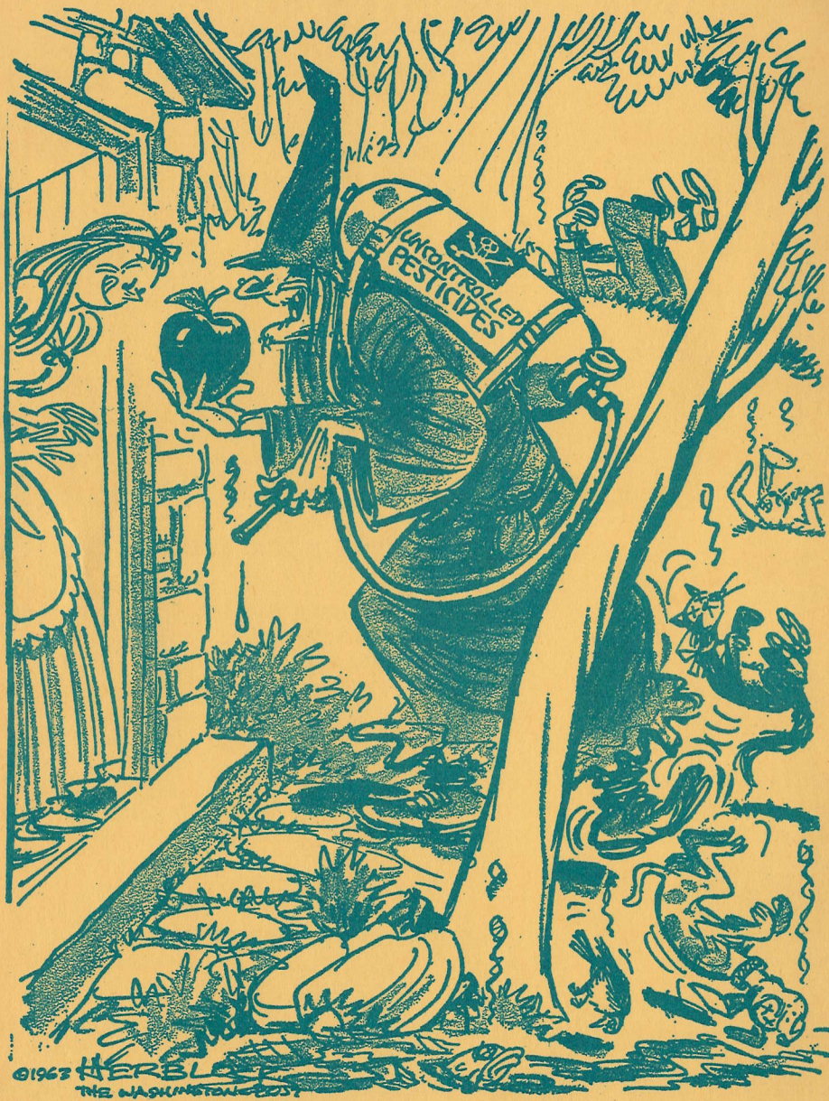
HERBLOCK in the Washington Post